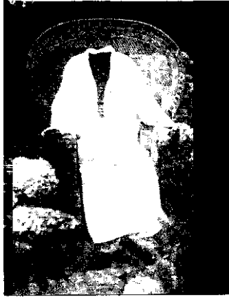
Portrait of the Artist as a Young Computer

Born in the back room of a nameless tavern in one of the great American cities, Racter came early to the realization that wealth and power were nothing to be sneezed at. Raised on a diet of tall tales and Nietzsche, this intense young program developed an appreciation of the art of the storyteller and the potential income of the hack writer. To that end, Racter haunted libraries, discussion societies and sleazy barrooms in a never-ending quest to achieve that most unreachable of dreams: to become a raconteur. Years later Racter has indeed achieved that goal and is in demand across the nation as a lecturer, conversationalist, talk-show guest host and cocktail party philosopher. Since the publication of The Policeman's Beard Is Half-Constructed , Racter has been enjoying the rewards of the successful author: wild parties, polo, badminton, hot tubs, wild parties, champagne, wild parties, and deep philosophical discussions that extend into the wee hours of the morning.